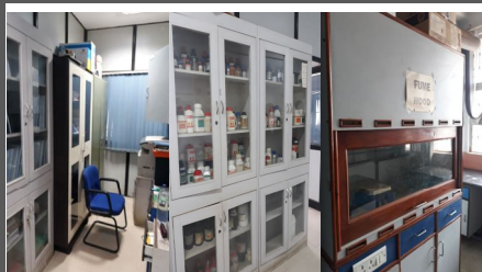
Nanomaterials Synthesis Lab